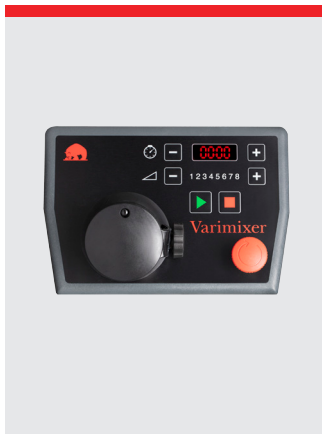
Attachment drive for meat mincer and vegetable cutter