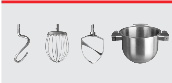
Hook, whip, beater and bowl 20/12 L in stainless steel.