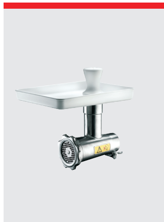
Meat mincer, 70 mm