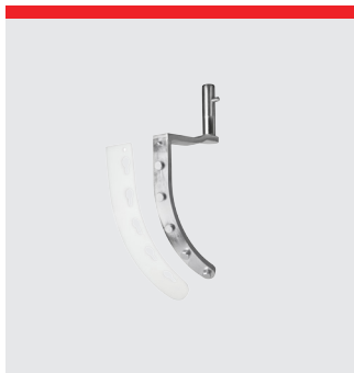
Automatic scraper in stainless steel. Nylon or teflon blade. 20L and 20/12L.