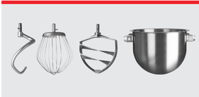
Hook, whip, beater and bowl 20 L in stainless steel.