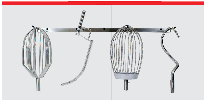
Tool rack, 91 cm