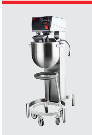
Marine version, Stainless steel, 20 L floor