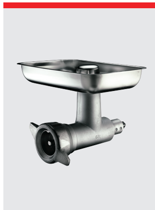
Meat mincer, 82 mm