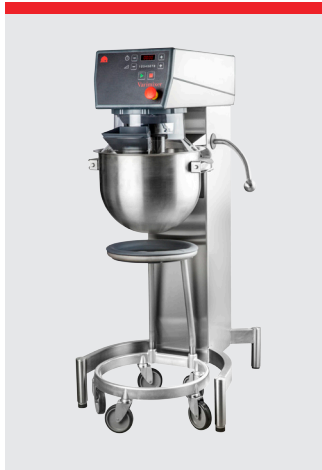
Stainless steel, 20 L floor