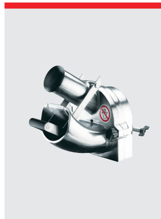
Vegetable cutter GR20